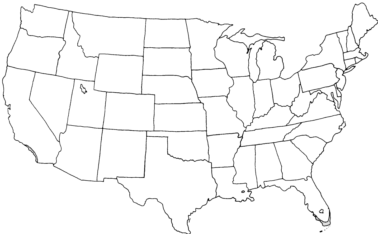
Figure 2. Range