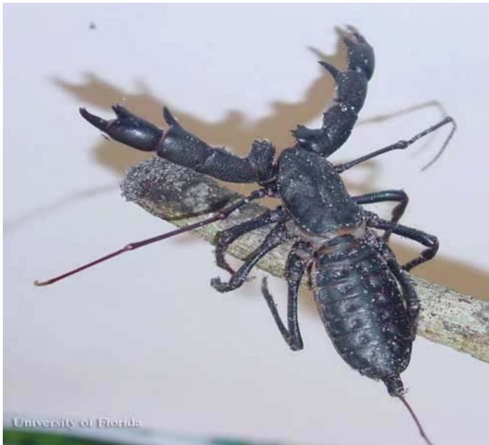
Figure 1. The giant whip scorpion or ‘vinegaroon’, Mastigoproctus giganteus giganteus (Lucas).

The only whip scorpion found in the United States is the giant whip scorpion, Mastigoproctus giganteus giganteus (Lucas). The giant whip scorpion is also known as the ‘vinegaroon’ or ‘grampus’ in some local regions where they occur. To encounter a giant whip scorpion for the first time can be an alarming experience! What seems like a