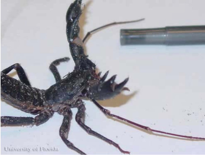
Figure 5. The giant whip scorpion or 'vingaroon', Mastigoproctus giganteus giganteus (Lucas), displaying defensive stance with spread pedipalps.

acid from a pore at the base of the caudal filament to a distance of a few inches to one foot. This defensive spray is not dangerous to skin but stings severely if it gets into an animal's eyes or nostrils.