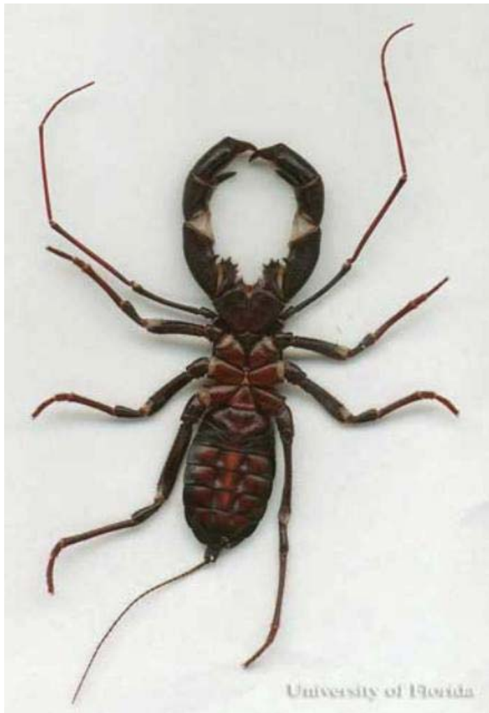
Figure 3. Ventral view of the giant whip scorpion or 'vingaroo', Mastigoproctus giganteus giganteus (Lucas).